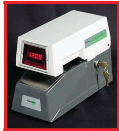
Model T-3 available without digital display