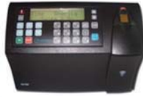
Web Clock / Timesheet Employee Self Service